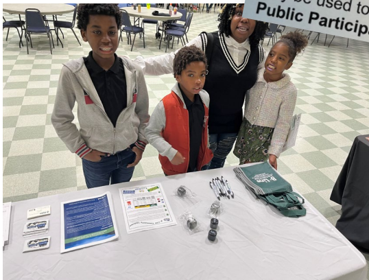
Chico Farmers Market